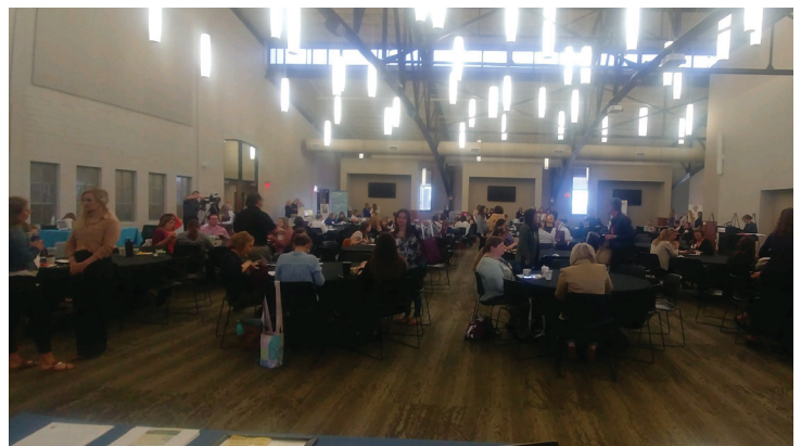
Registered nutritionists and dietitians from across the state gathered for their annual convention. Nebraska Wheat participated in the trade show, sharing info on gluten and grains.