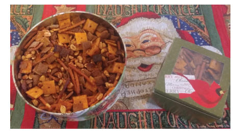
Ranch Snack Mix