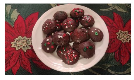
Holiday Thin Mint Cookies