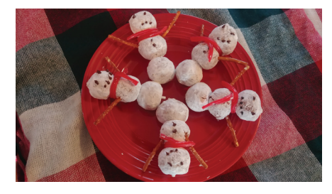
Donut Snoman Pops