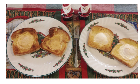
Holiday Eggs in a Basket