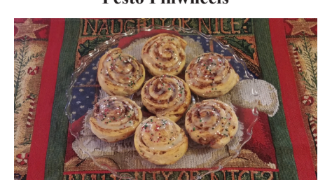
Eggnog Cinnamon Rolls