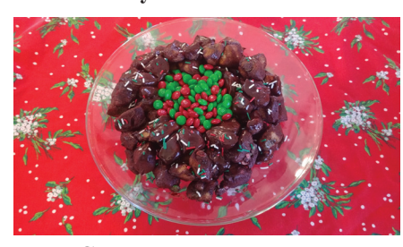
Chocolate Monkey Bread