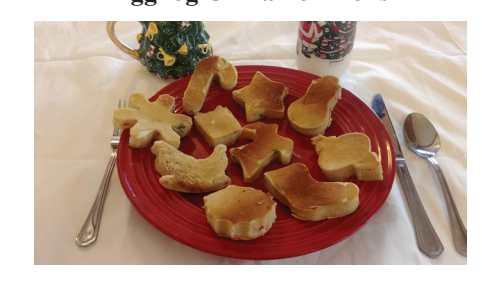
Holiday Funfetti Pancakes